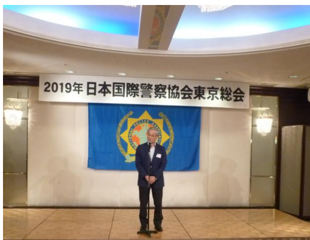
Speaking at the AGM in Tokyo

We plan to take you on a Bullet Train trip in the season of cherry blossoms, from Tokyo to the ancient capital of Kyoto, the samurai-era castle of Himeji, the peace memorials in Hiroshima, and to the beautiful lake at the foot of Mt. Fuji. We look forward to welcoming many IPA friends from around the world.