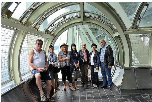
Sur le pont suspendu d' Akashikaikyo